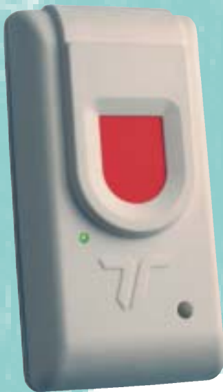
Original-size ManDown position sensor

According to studies carried out by SUVA, the probability of making a mistake is greater for people who work alone. At the same time they are exposed to a significantly greater risk of not receiving help promptly in a crisis or accident situation. The TeleAlarm® ManDown wireless emergency call system reduces this risk to an absolute minimum.